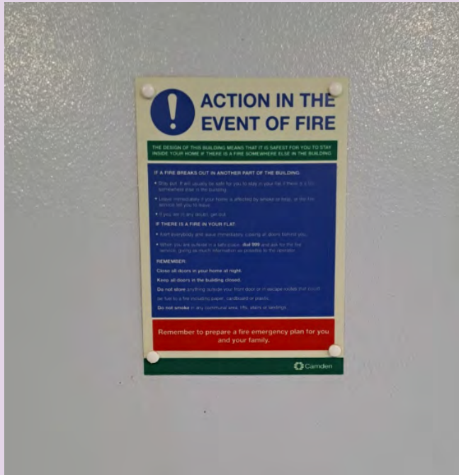
Fire Action Notice at 1-27 Hazel House.

We have installed Fire Action Notices in your building.