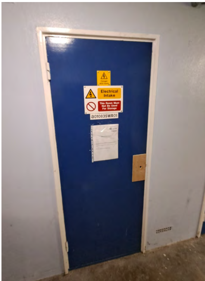
Electrical Intake Cupboard Fire Door at 1-27 Hazel House.

Doors to plant rooms, electrical intake and lift motor rooms (including fire rated hatches or panels)