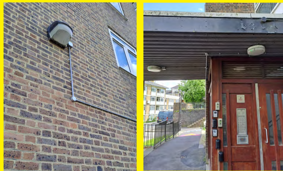
Emergency lighting at 1-27 Hazel House.

Emergency lighting provides illumination in instances where mains power may have failed. It illuminates escape routes, emergency exit/s and firefighting equipment. It will provide illumination to signage and provide sufficient lighting to help you to escape.