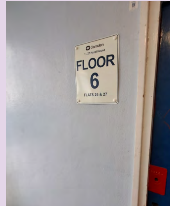
Wayfinding signage at 1-27 Hazel House.

Wayfinding signage is a visual communication tool to assist the Fire and Rescue Service in locating specific flats as they navigate their way round a building.