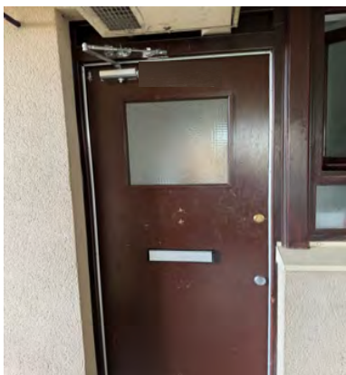
Front Entrance Door at Bedefield.

There are communal fire doors in this building. Your front door may be a fire door.