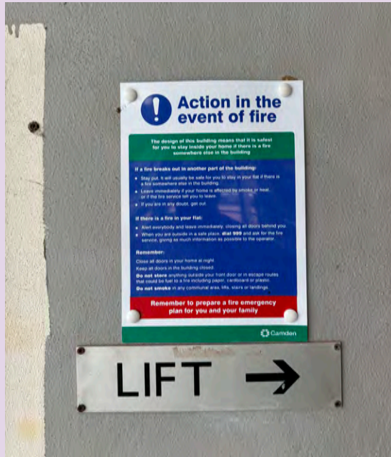
Fire Action Notice at Bedefield.

We have installed Fire Action Notices in your building.