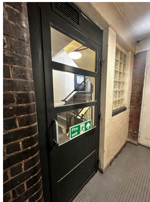
Communal fire door at Riverside.