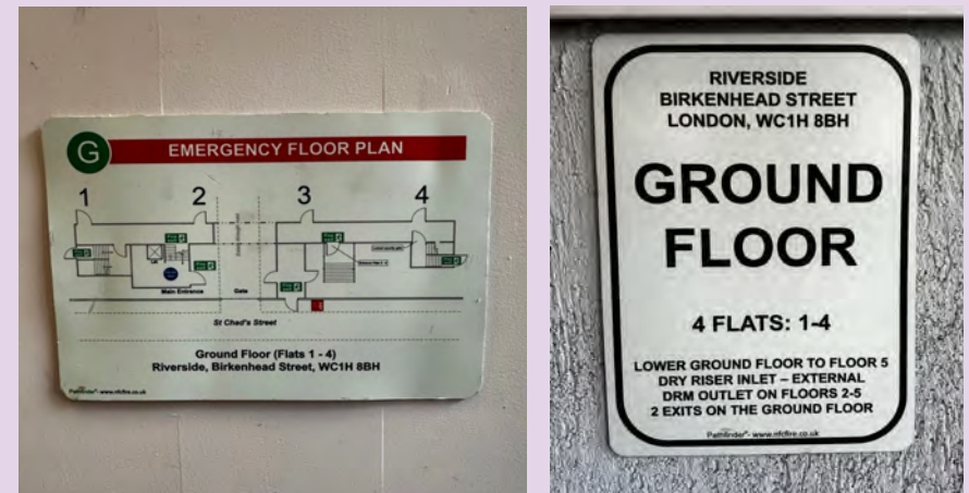
Various Wayfinding Signage at Riverside.

Wayfinding signage is a visual communication tool to assist the Fire and Rescue Service in locating specific flats as they navigate their way round a building.