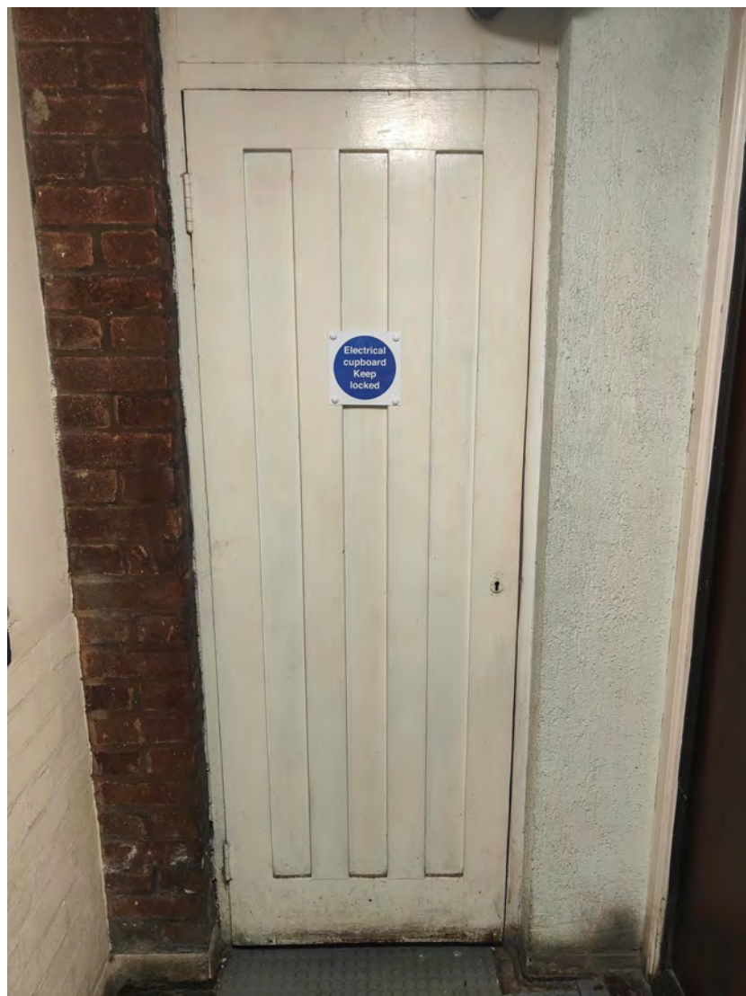
Electrical intake cupboard fire door at Riverside.

Doors to plant rooms, electrical intake and lift motor rooms (including fire rated hatches or panels)