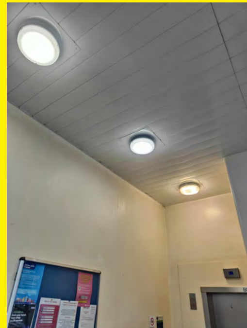
Emergency lighting at Riverside.

Emergency lighting provides illumination in instances where mains power may have failed. It illuminates escape routes, emergency exit/s and firefighting equipment. It will provide illumination to signage and provide sufficient lighting to help you to escape.