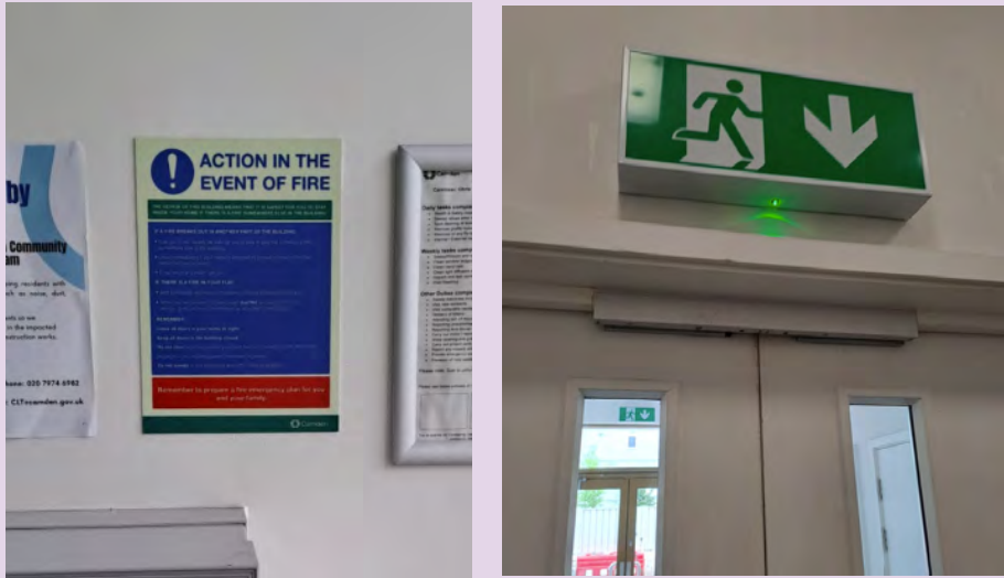
Fire Action Notice and Fire Exit Sign at Mardale.

We have installed Fire Action Notices and Fire Exit Signs in your building.