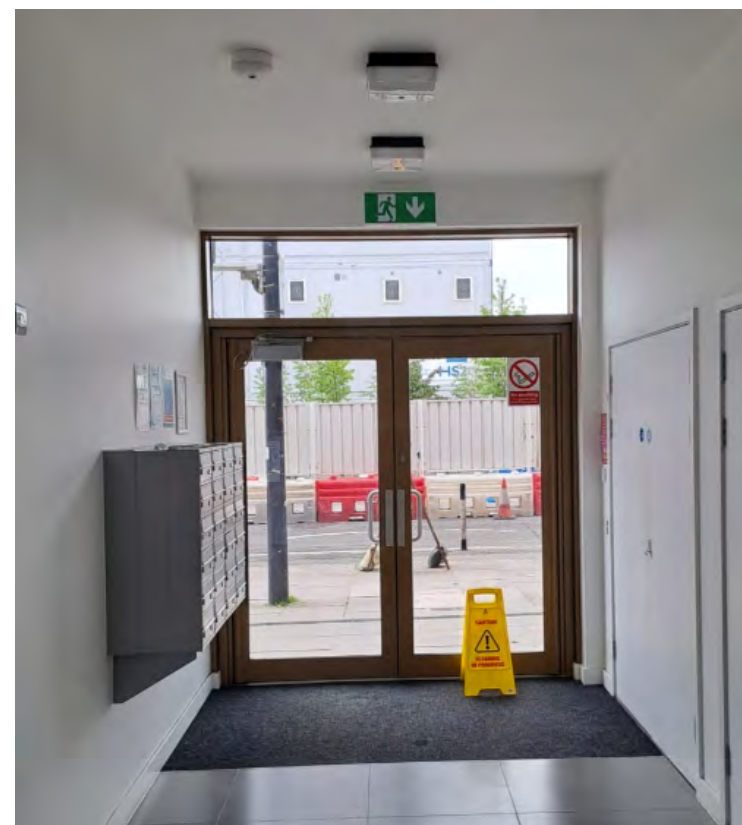
Communal Fire Door at Mardale .