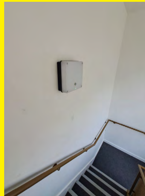
Emergency lighting at Mardale.

Emergency lighting provides illumination in instances where mains power may have failed. It illuminates escape routes, emergency exit/s and firefighting equipment. It will provide illumination to signage and provide sufficient lighting to help you to escape.