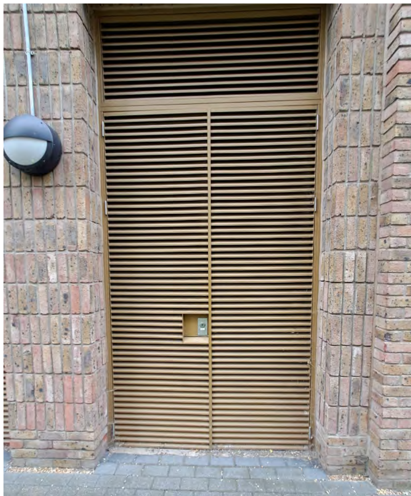
Plant Room Door at Mardale.

Doors to plant rooms, electrical intake and lift motor rooms (including fire rated hatches or panels)