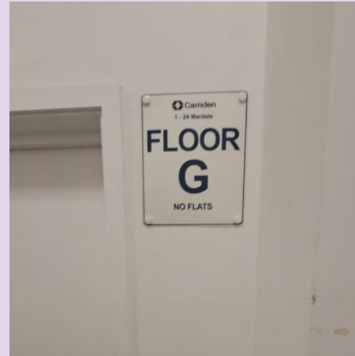
Wayfinding signage at Mardale.

Wayfinding signage is a visual communication tool to assist the Fire and Rescue Service in locating specific flats as they navigate their way round a building.