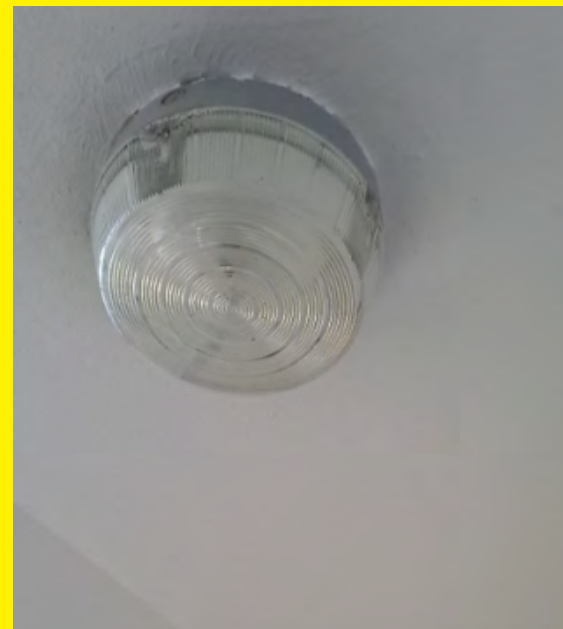
Emergency lighting at Glover House.

Emergency lighting provides illumination in instances where mains power may have failed. It illuminates escape routes, emergency exit/s and firefighting equipment. It will provide illumination to signage and provide sufficient lighting to help you to escape.