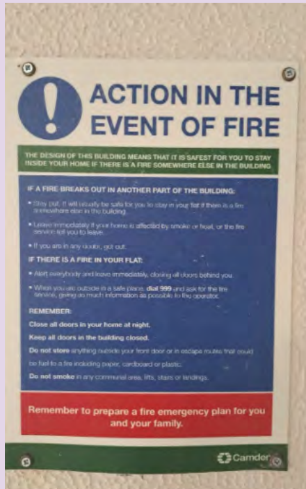
Fire Action Notice at Glover House.

We have installed Fire Action Notices and Fire Exit Signs in your building.