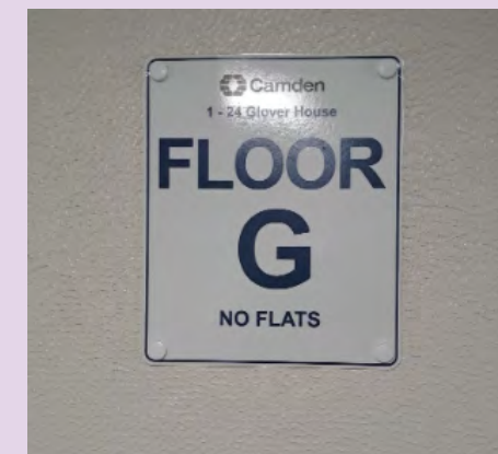
Wayfinding signage at Glover House.

At Glover House, wayfinding signage is located on each floor in the stairwells and in the lift lobby.