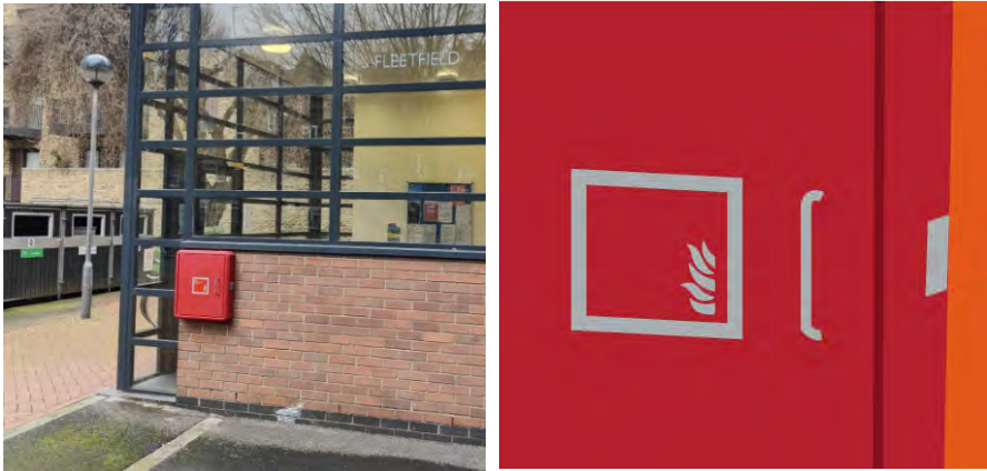
Secure Information Box at Fleetfield.

Secure Information Boxes are easily identifiable storage units for documents intended for use by the fire and rescue service during a fire.