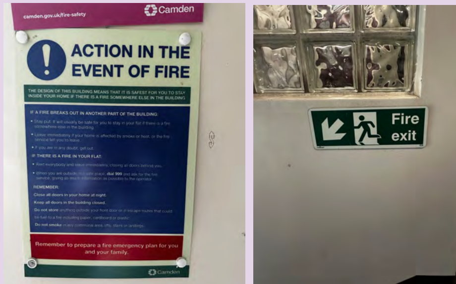
Fire Action Notice and Fire Exit Signs at Fleetfield.

We have installed Fire Action Notices and Fire Exit Signs in your building.