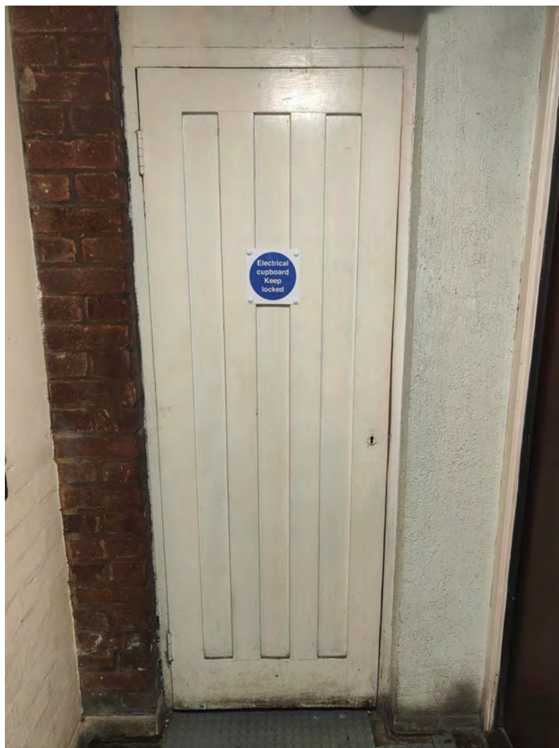
Electrical intake cupboard fire door at Fleetfield.

Doors to plant rooms, electrical intake and lift motor rooms (including fire rated hatches or panels)