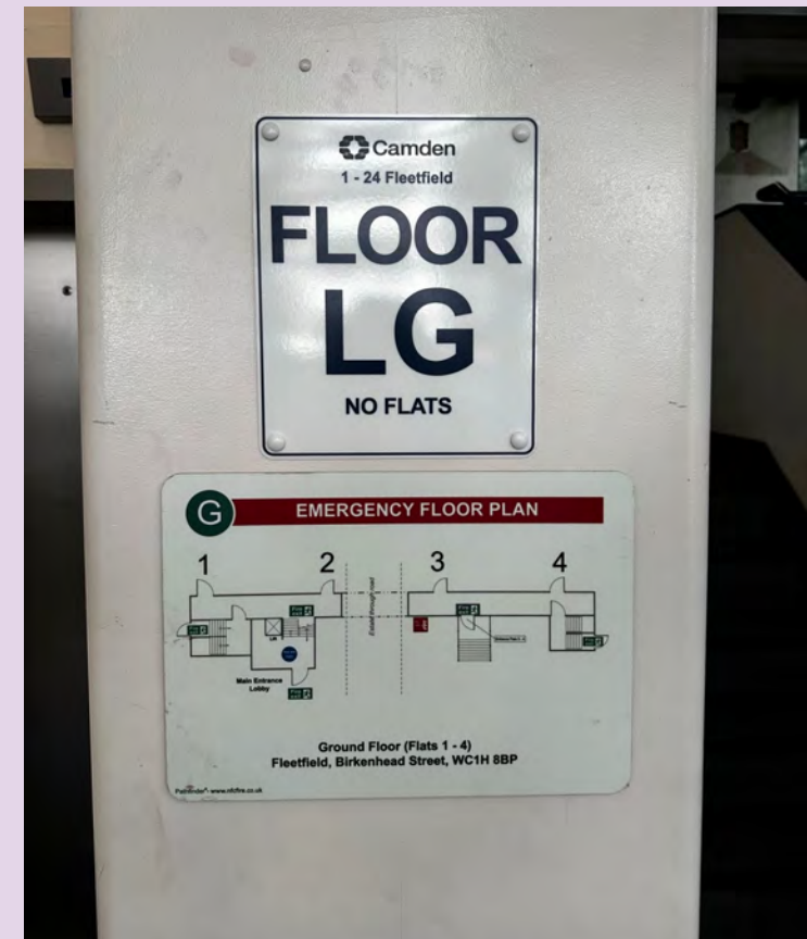
Wayfinding signage at Fleetfield.

Wayfinding signage is a visual communication tool to assist the Fire and Rescue Service in locating specific flats as they navigate their way round a building.