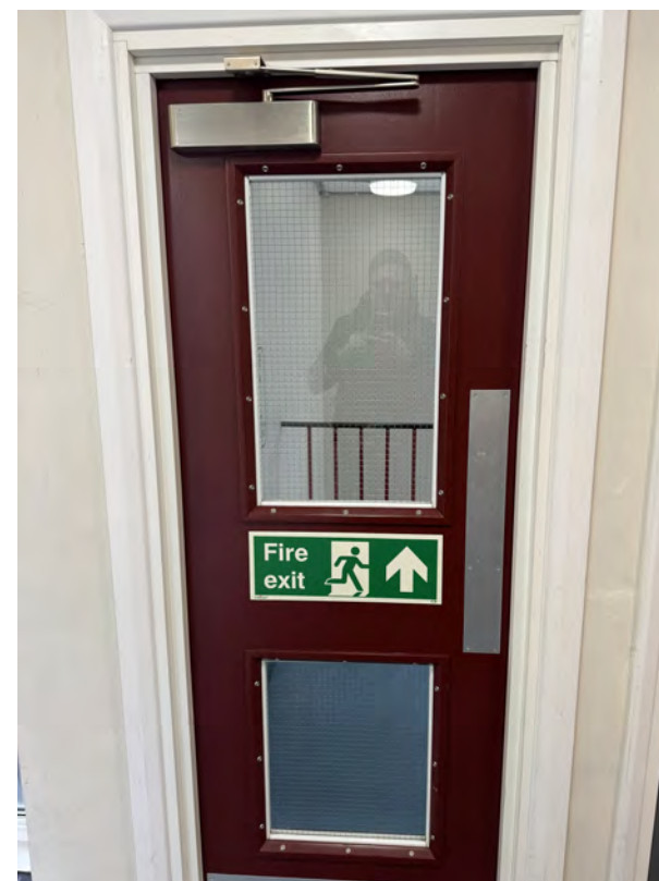
Communal door leading to stairwell at Falcon House.