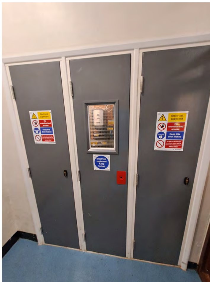
Electrical intake cupboard fire door at Falcon House.

Doors to plant rooms, electrical intake and lift motor rooms (including fire rated hatches or panels)