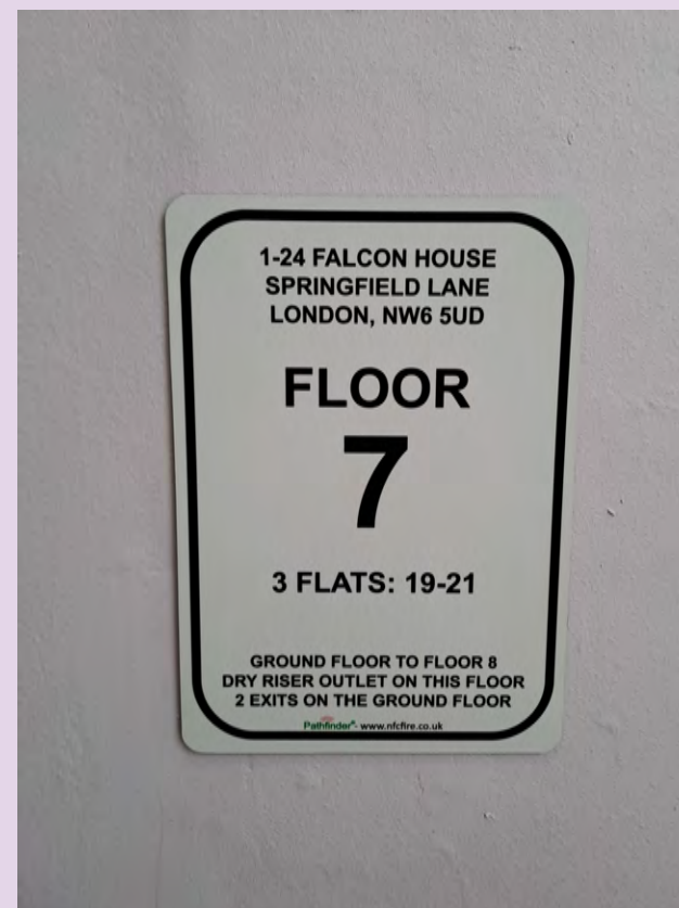
Wayfinding signage at Falcon House.

Wayfinding signage is a visual communication tool to assist the Fire and Rescue Service in locating specific flats as they navigate their way round a building.