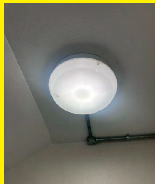
Emergency Lighting at Falcon House.

The lighting should illuminate all escape routes, emergency exit/s and firefighting equipment.