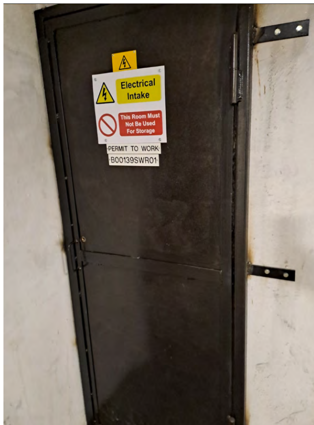
Electrical Intake Cupboard Door at 1-23 Grisedale.

Doors to plant rooms, electrical intake and lift motor rooms (including fire rated hatches or panels)