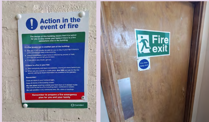
Fire Action Notice Fire Exit Sign at 1-23 Grisedale.

We have installed Fire Action Notices and Fire Exit Signs in your building.