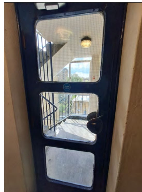
Communal Fire Door at 1-23 Grisedale.