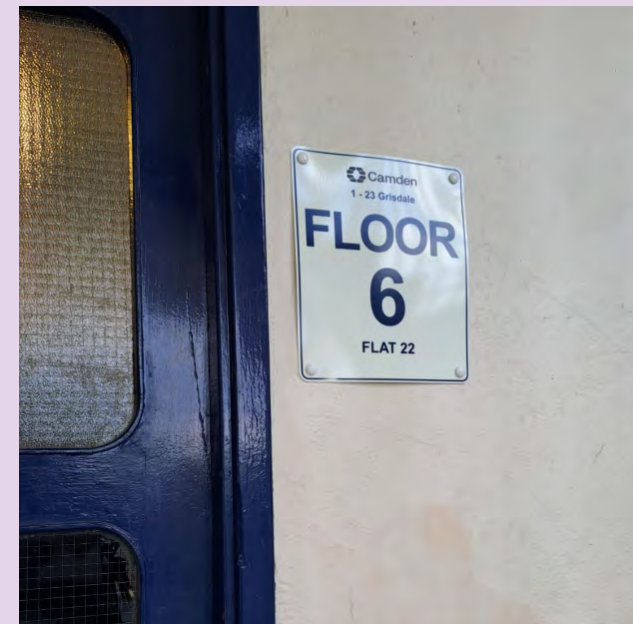
Wayfinding signage at 1-23 Grisedale.

Wayfinding signage is a visual communication tool to assist the Fire and Rescue Service in locating specific flats as they navigate their way round a building.