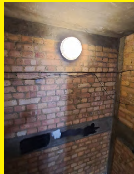
Emergency lighting at 1-23 Grisedale.

Emergency lighting provides illumination in instances where mains power may have failed. It illuminates escape routes, emergency exit/s and firefighting equipment. It will provide illumination to signage and provide sufficient lighting to help you to escape.