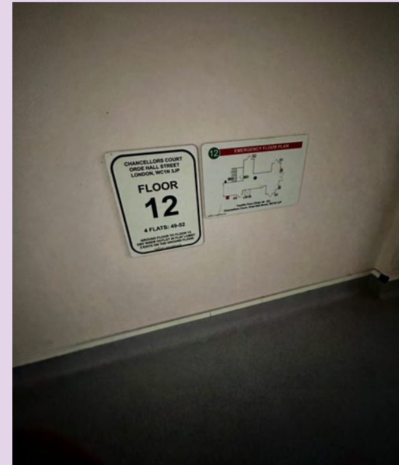
Wayfinding signage at O'Donnell Court.

Wayfinding signage is a visual communication tool to assist the Fire and Rescue Service in locating specific flats as they navigate their way round a building.