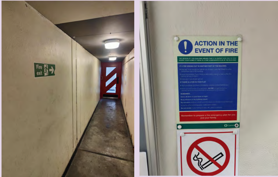
Fire Exit Sign and Fire Action Notice at O'Donnell Court.

We have installed Fire Action Notices and Fire Exit signs in your building.