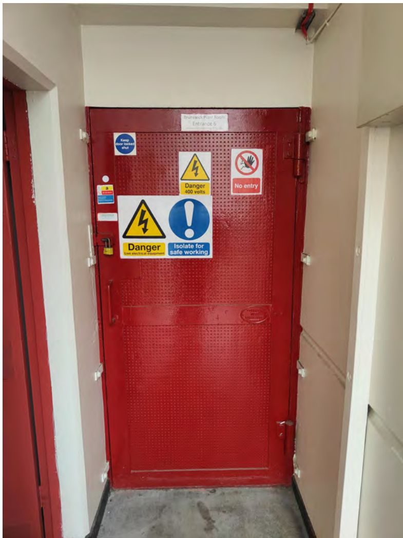
Plant Room Fire Door at O'Donnell Court.

Doors to plant rooms, electrical intake and lift motor rooms (including fire rated hatches or panels)