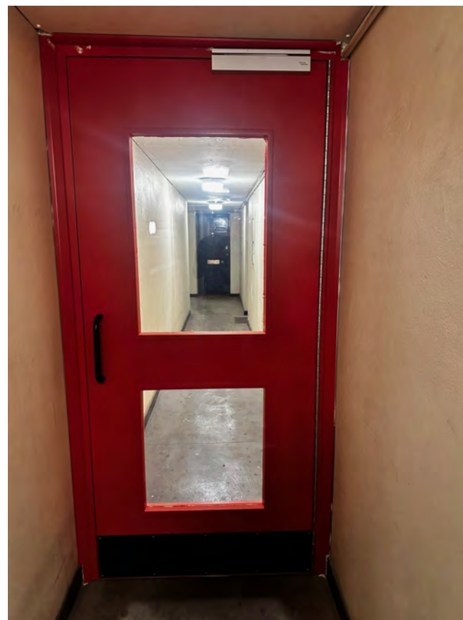
Communal area fire door at O'Donnell Court.