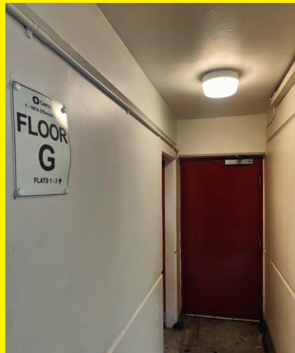
Emergency lighting at O'Donnell Court.

Emergency lighting provides illumination in instances where mains power may have failed. It illuminates escape routes, emergency exit/s and firefighting equipment. It will provide illumination to signage and provide sufficient lighting to help you to escape.