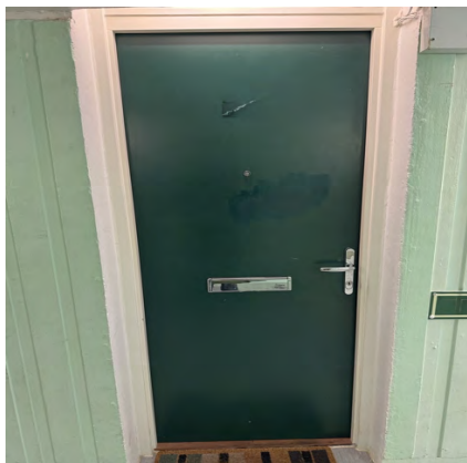
Front Entrance Door at Taplow Tower.

In your building, doors to the communal hallway, stairs, riser/ electrical cupboards and hatches are fire doors Your front door may be a fire door.