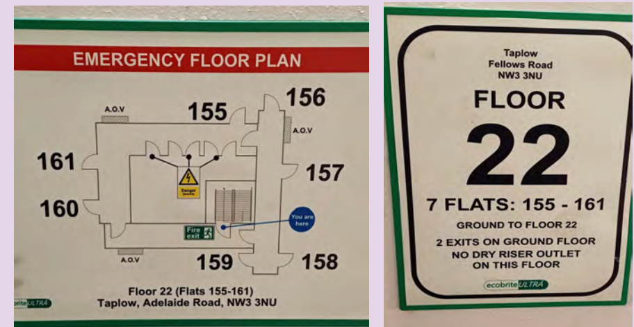
Wayfinding signage at Taplow Tower.

Wayfinding signage is a visual communication tool to assist the Fire and Rescue Service in locating specific flats as they navigate their way round a building.