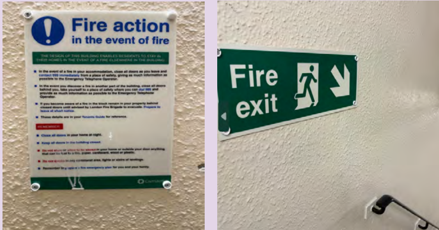
Fire Action Notices and Fire Exit Signs at Taplow Tower.

We have installed Fire Action Notices and Fire Exit signs in your building.