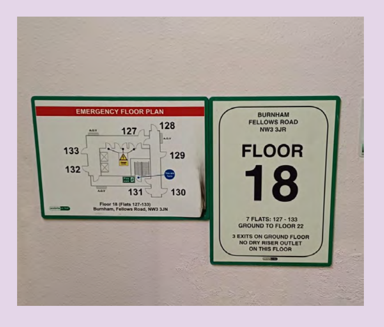
Wayfinding signage at Burnham.

Wayfinding signage is a visual communication tool to assist the Fire and Rescue Service in locating specific flats as they navigate their way round a building.