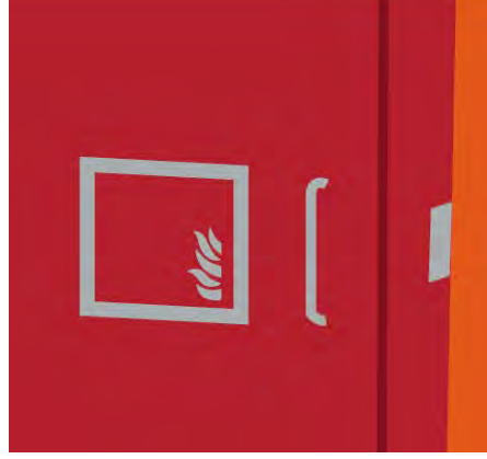
Secure Information Box at Burnham.

If you need help in the event of an emergency such as a fire, due to a physical disability or long term medical condition or another disorder, please let us know.