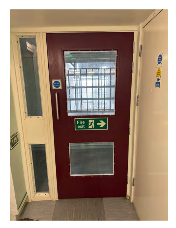
Communal area fire door at Burnham.