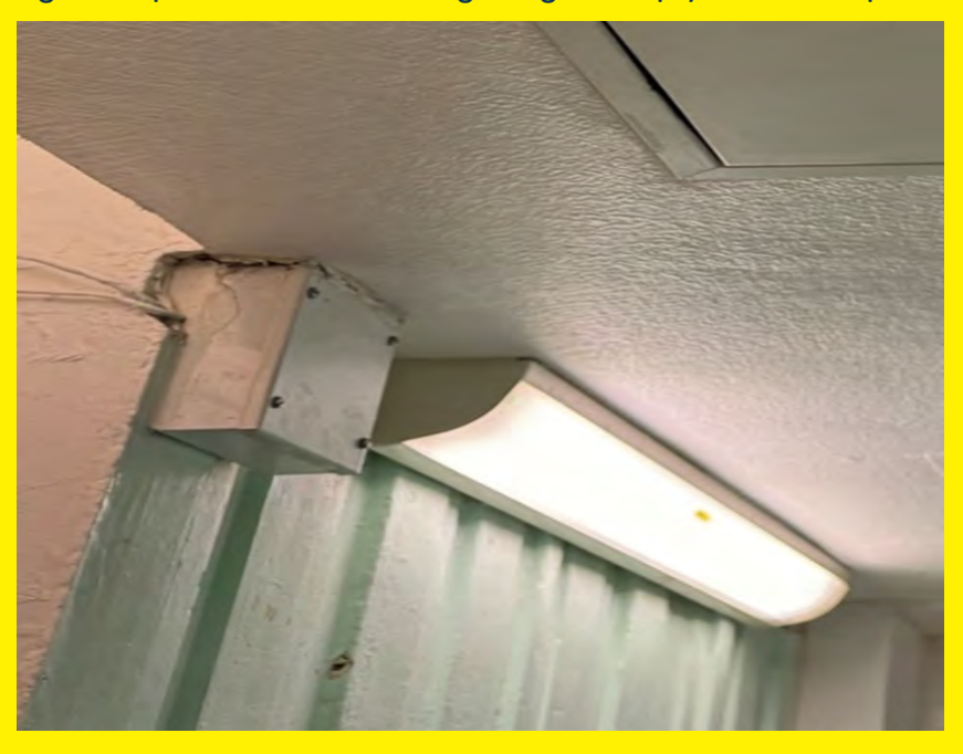
Electrical lighting at Burnham,

Emergency lighting provides illumination in instances where mains power may have failed. It illuminates escape routes, emergency exit/s and firefighting equipment. It will provide illumination to signage and provide sufficient lighting to help you to escape.