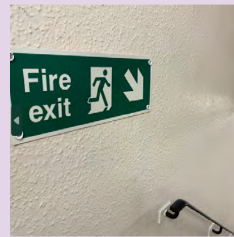
Fire Action Notices and Fire Exit Signs at Burnham.