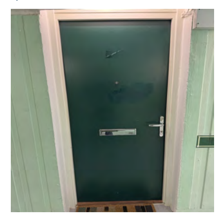
Front Entrance Door at Burnham.

In your building, doors to the communal hallway, stairs, riser/ electrical cupboard and ,hatches are fire doors Your front door may be a fire door.