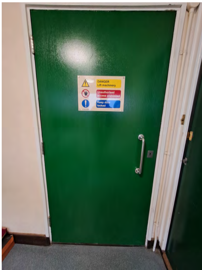
Lift Motor Room Fire Door at Whitebeam House.

Doors to plant rooms, electrical intake and lift motor rooms (including fire rated hatches or panels)