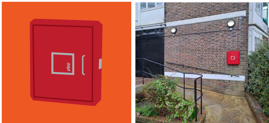
Secure Information Box at Whitebeam House.

Secure Information Boxes are easily identifiable storage units for documents intended for use by the fire and rescue service during a fire.