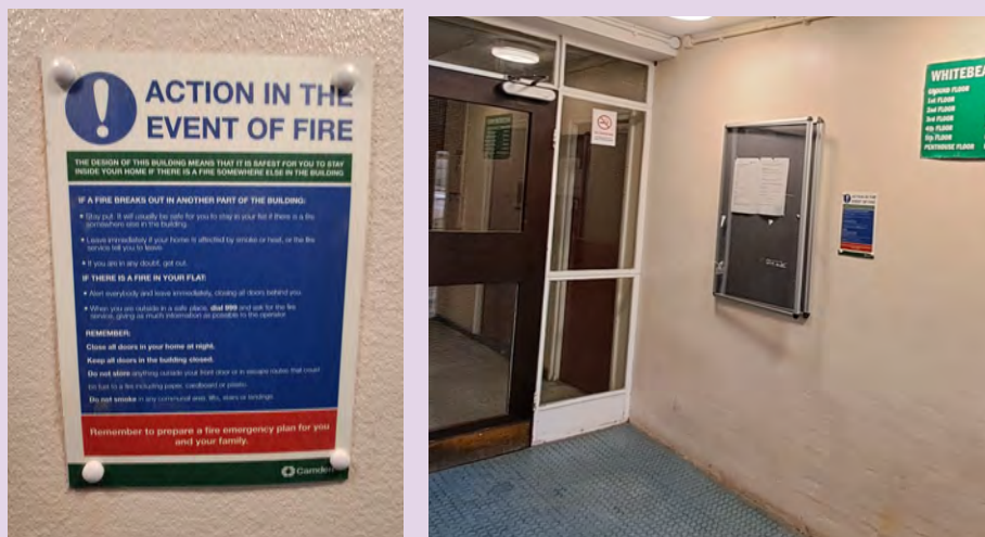
Fire action notice at Whitebeam House.

We have installed a fire action notice in your building.