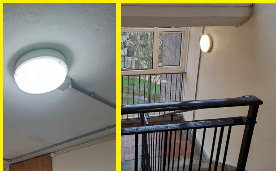
Wayfinding signage in stairwells at Whitebeam House.

The lighting should illuminate all escape routes, emergency exit/s and firefighting equipment.