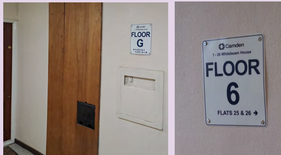
Various wayfinding signage at Whitebeam House.

Wayfinding signage is a visual communication tool to assist the Fire and Rescue Service in locating specific flats as they navigate their way round a building.