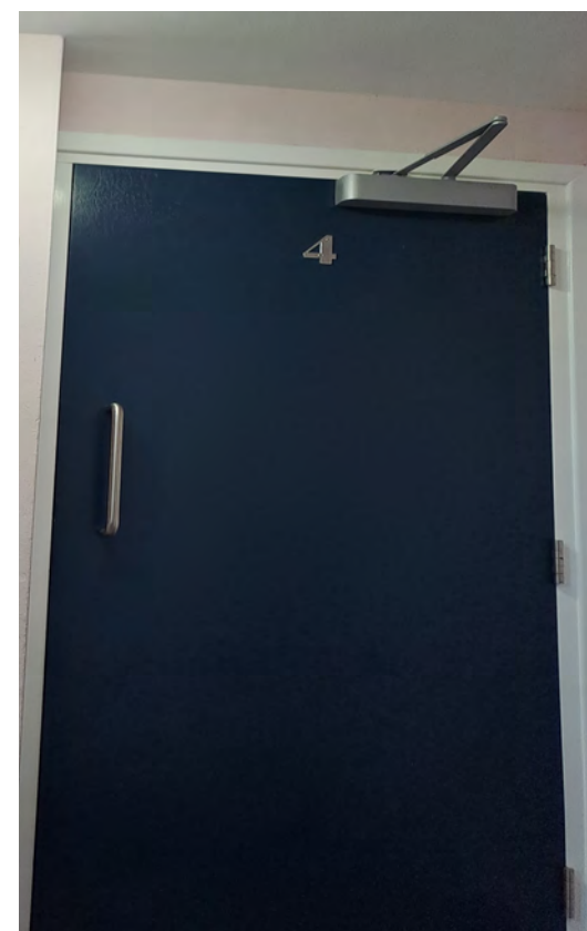
Communal Fire Doors at Vesage Court.