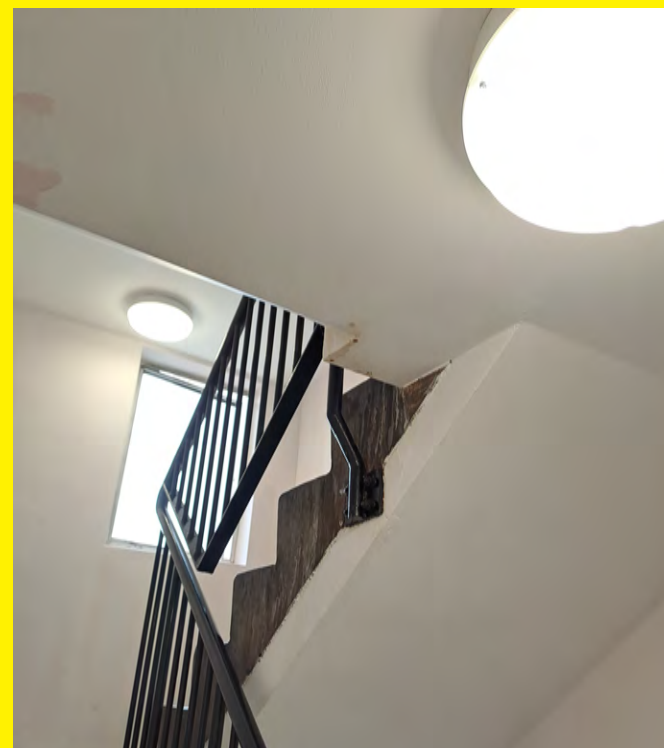
Wayfinding signage at Vesage Court.

The lighting should illuminate all escape routes, emergency exit/s and firefighting equipment.