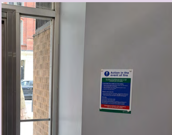
Fire Action Notice in Vesage Court.

We have installed Fire Action Notices and Fire Exit Signs in your building.