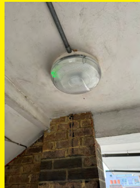
Emergency lighting at Tresham House.

Emergency lighting provides illumination in instances where mains power may have failed. It illuminates escape routes, emergency exit/s and firefighting equipment. It will provide illumination to signage and provide sufficient lighting to help you to escape.