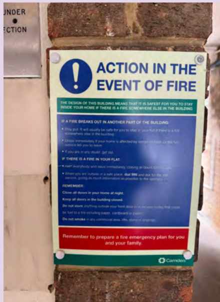
Fire Action Notice at Tresham House.

We have installed fire action notices and fire exit signs in your building.