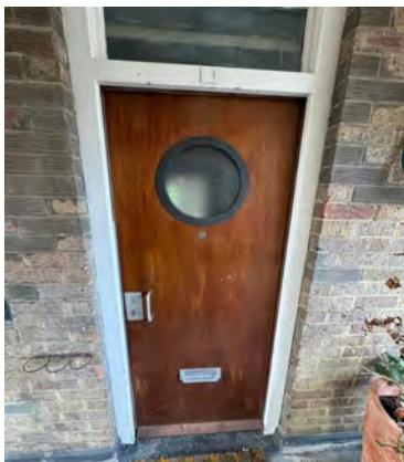
Front Entrance Door at Tresham House.

In your building, the doors into corridors, hallways and stairwells are fire doors. Your front door may be a fire door.