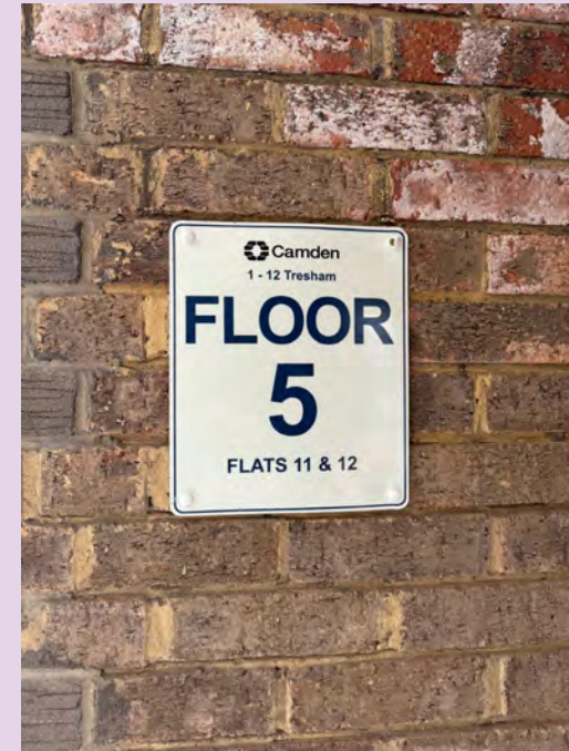
Wayfinding signage at Tresham House.

Wayfinding signage is a visual communication tool to assist the Fire and Rescue Service in locating specific flats as they navigate their way round a building.