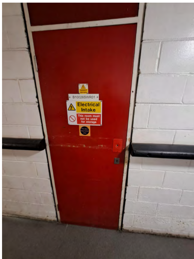
Electrical Intake Cupboard Fire Door at Woodhall.

Doors to plant rooms, electrical intake and lift motor rooms (including fire rated hatches or panels)