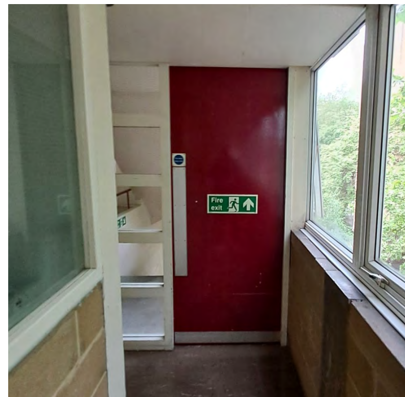
Communal Fire Door at Woodhall.