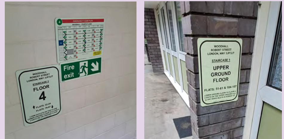
Various wayfinding signage at Woodhall.

Wayfinding signage is a visual communication tool to assist the Fire and Rescue Service in locating specific flats as they navigate their way round a building.