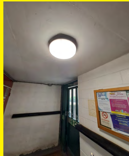
Emergency lighting at Woodhall.

Emergency lighting provides illumination in instances where mains power may have failed. It illuminates escape routes, emergency exit/s and firefighting equipment. It will provide illumination to signage and provide sufficient lighting to help you to escape.