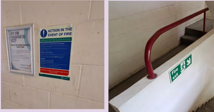
Fire Action Notice and Fire Exit Sign at Woodhall.

We have installed Fire Action Notices and Fire Exit Signs in your building.